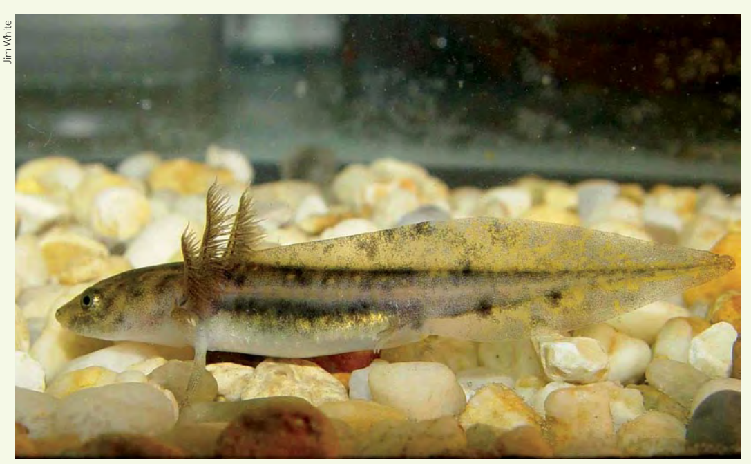
External gills identify this larvae as a salamander (frog gills are internal). Eastern Tiger Salamanders have a long larval period of from 75 to 205 days. Survival is low due to diverse predators and the drying out of seasonal ponds.

It is believed females leave the pond soon after they deposit their eggs. Males stay in the pond for weeks, attempting to mate with every female that presents herself,