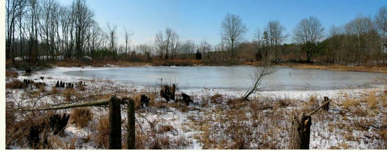
Massey Pond, late January 2009; Do tiger salamanders lurk under the ice? Only time and a thaw will tell!

By 1984, only seven ponds in two Eastern Shore counties (Caroline and Kent) held tiger salamanders, down from a total of 18 historic sites. This decline was attributed to wetland loss, deforestation, water pollution, and vegetative succession (pond basins becoming dominated by